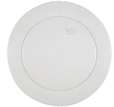
364887-01 In-Ceiling Wireless Access Point, 802.11g