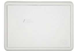
364891-01 In-Wall Wireless Access Point, 802.11g